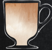
TAZO. CHAI LATTE